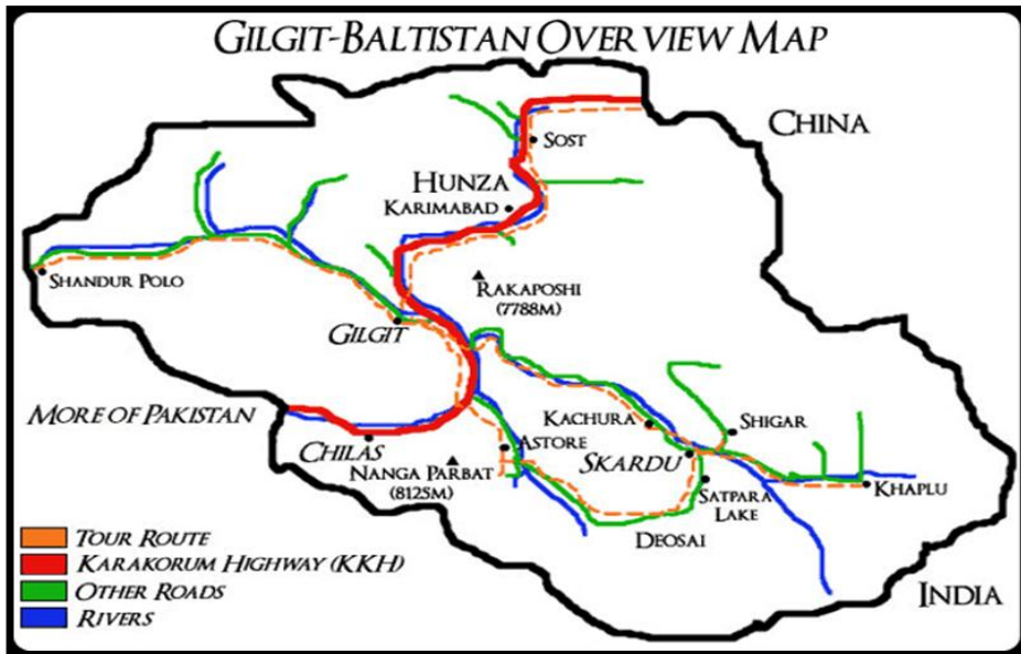
Map No. 1

43