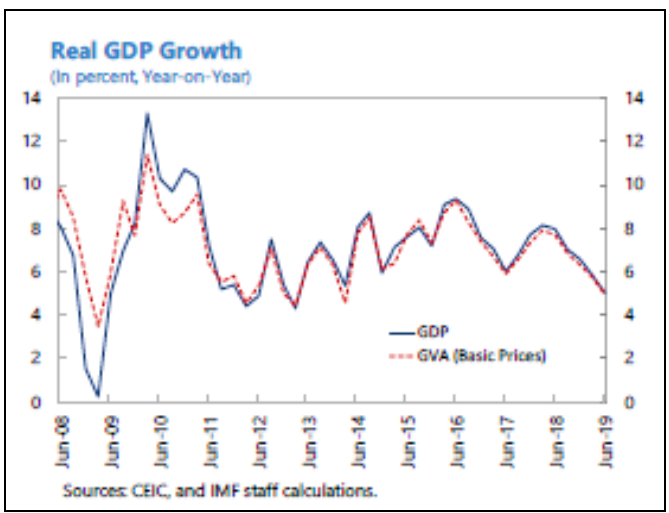
Figure No.1 Indian Economy's Performance Under Modi Regime since 2014